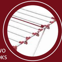
INBUILT TWO SIDED HOOKS